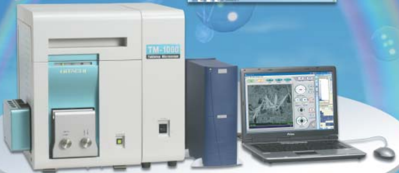
Typical Configuration of TM-1000 with SwiftED-TM